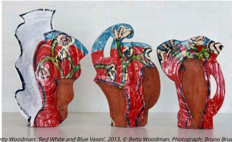
Betty Woodman: 'Red White and Blue Vases', 2013. © Betty Woodman.

Royal Academy of Arts. Jan 30 to Apr 20.