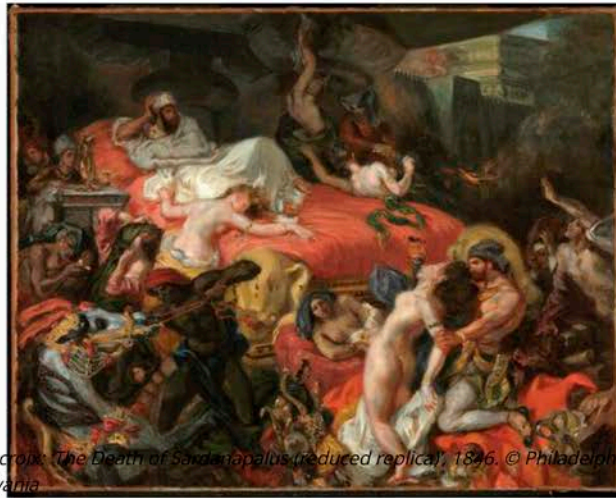
Eugene Delacroix: The Death of Sardanapalus (reduced replica), 1826.

Dulwich Picture Gallery. Feb 5 to May 15.