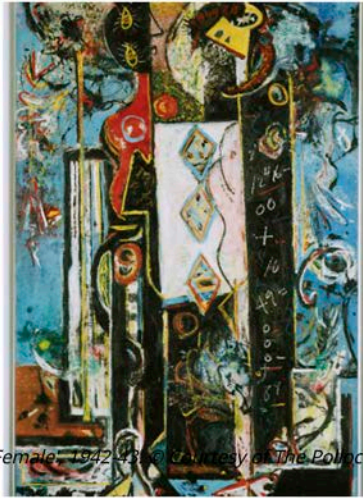
Jackson Pollock: 'Male and Female', 1942-43. Oil on canvas.