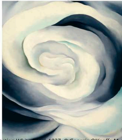
Georgia O'Keeffe: 'Abstraction White Rose', 1927.