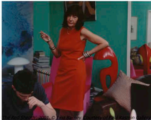
Tina Barney: 'The Red Sheath' 2001.