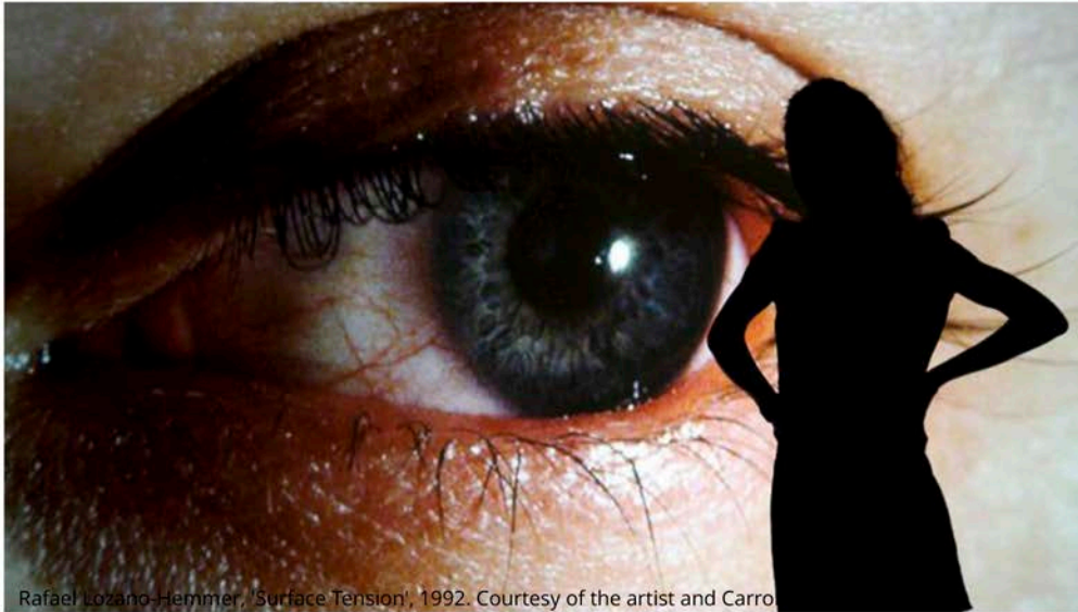
Rafael Lozano-Hemmer, 'Surface Tension', 1992. Courtesy of the artist and Carro