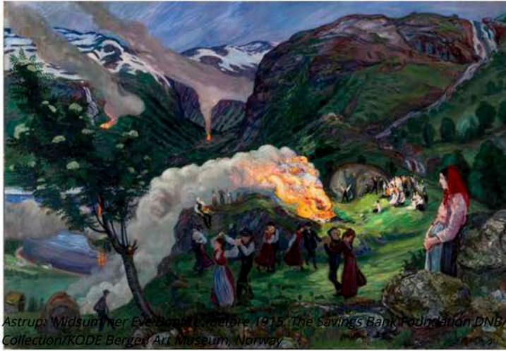
Nikolai Astrup: Midsummer Eve (1915). The Savings Bank Foundation DNB/The Astrup Collection/KODE Bergen Art Museum, Norway