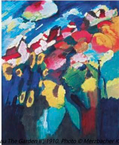
Wassily Kandinsky, 'Murnau The Garden II', 1910.