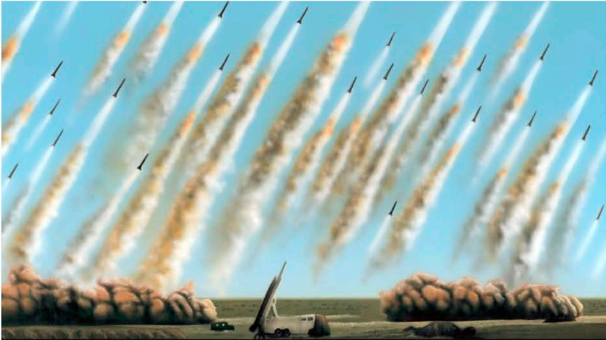
Oliver Laric, Versions (Missile Variations) (2010) Private Collection, London. Image courtesy the artist and Seventeen Gallery, London © Oliver Laric

Electronic Superhighway begins with works made between 2000 – 2016, and ends with Experiments in Art and Technology (E.A.T), an iconic, artistic moment that took place in 1966. Spanning 50 years, from 2016 to 1966, key moments in the history of art and the Internet emerge as the exhibition travels back in time.