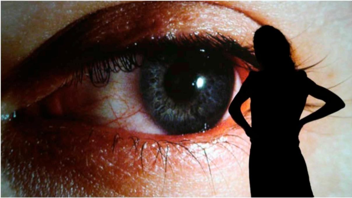
Rafael Lozano-Hemmer, Surface Tension (1992) Courtesy the artist and Carroll/Fletcher, London. Installation photograph by Maxime Dufour © Rafael Lozano-Hemmer