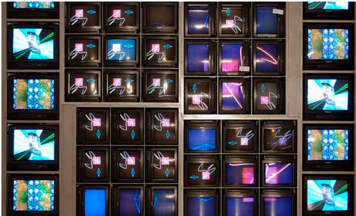
Nam June Paik, Internet Dream (1994), video sculpture, 287 x 380 x 80 cm. ZKM | Collection © (2008) ZKM | Center for Art and Media Karlsruhe, Photo: Steffen Harms

The dot-com boom, from the late 1990s to early millennium, is examined through work from international artists and collectives such as The Yes Men ( http://theyesmen.org ) who combined art and online activism in response to the rapid commercialisation of the web.