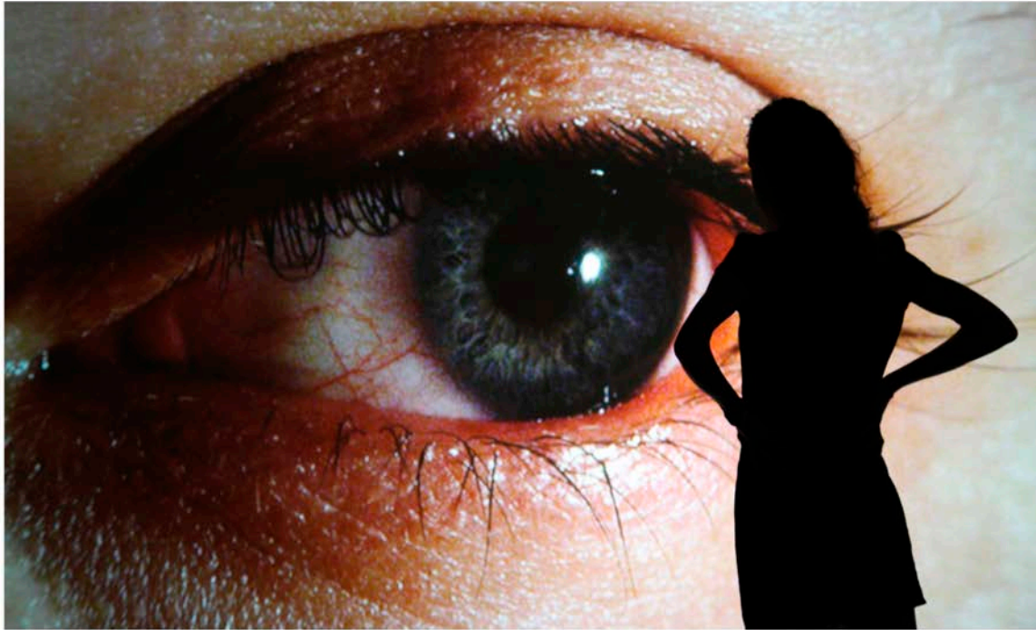
Rafael Lozano-Hemmer, Surface Tension , 1992

How computers and the Internet have impacted on artists' ways of working has become an incisive curatorial subject. The latest exhibition in this vein is Electronic Superhighway at the Whitechapel Gallery in London, which pinpoints the proliferation of art mining new media ideas. In previewing the show, DAMN° had a chance to survey not only the tantalising atmosphere generated by such a concisely framed genre of work, but also to reflect on the bizarre fact that until 50 years ago, none of these pieces could have existed.