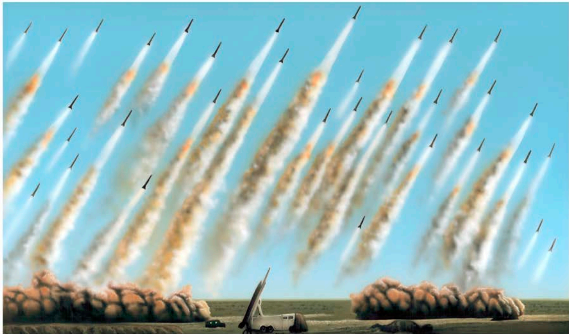
Oliver Laric, Versions (Missile Variations), 2010