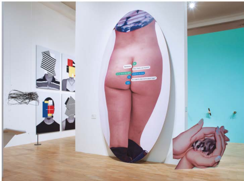
Installation view of “Electronic Superhighway (2016–1966),” 2016.

The curators argued convincingly that E.A.T.’s marrying of then-novel equipment such as video recorders, projectors, and infrared cameras with live performance, dance, and music made it an important precursor to the mixing of disciplines commonplace in art today. This thesis provided something of a through line for the show, a sprawling, euphoric cacophony of artworks across mediums, not unlike the audio-visual bombardment of information we experience daily from television, advertising, and the Internet.