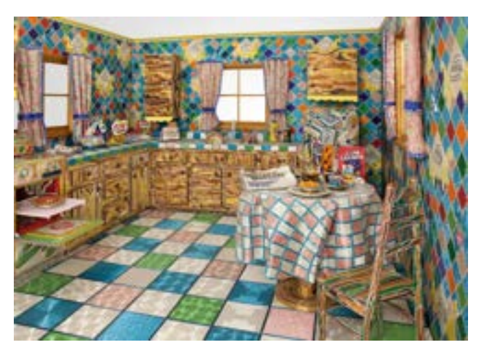
Liza Lou, "Kitchen" (1991–95) installation view (© Liza Lou; photo by Tony Cuñha)

During my tenure at the Kemper, we were fortunate to feature many terrific groundbreaking exhibitions. Liza Lou's beaded everyday environments, a fantasy world made of millions of glass