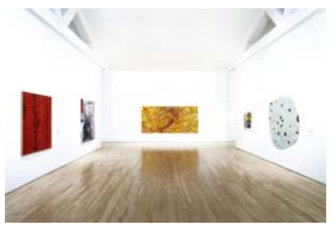
Installation view, "Magnetic Fields: Expanding American Abstraction 1960s to Today," June 8–Sept. 17, 2017.

Since its opening, I have frequented Kemper Museum. I was particularly moved by the provocative exhibitions of work by Frederick Brown, Kojo Griffin, Herb Ritts, and the Black women abstract painters of the "Magnetic Fields" exhibition. I was also honored to conduct a drawing event, screen my film "The Gospel According to Glenn North," and conduct a professional