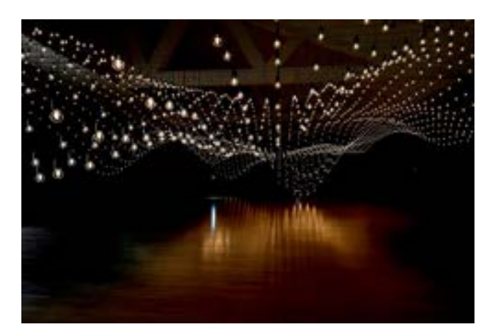
Installation view, "Rafael Lozano-Hemmer: Pulse Topology," June 25, 2021–Jan. 2, 2022

Kemper's darkened 5,000-squarefoot exhibition space with 3,000 LED filament bulbs hung from the ceiling in a configuration evoking the swells and valleys of the Flint Hills. Visitors were invited to place their hands under suspended sensors that detected their heartbeats through photoplethysmography (PPG) and transmitted the heartbeat's rhythm to the lightbulbs to ripple through the installation and visually merge with the pulse beats of other visitors, reminding