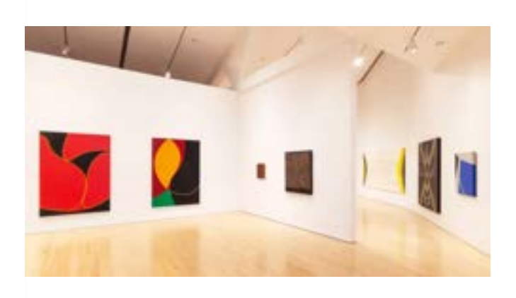
Installation view, "Virginia Jaramillo: Principle of Equivalence," June 2, 2023–Aug. 27, 2023

One of Kemper Museum of Contemporary Art's most remarkable achievements of the 21st century remains the summer 2023 retrospective exhibition "Principle of Equivalence," featuring the work of Virginia Jaramillo. With more than 70 pieces spanning the arc of Jaramillo's prolific imagination, from her early textured abstractions to the breathtaking "Site: No. 3 51.1789° N, 1.8262° W" (2018), the show demonstrated