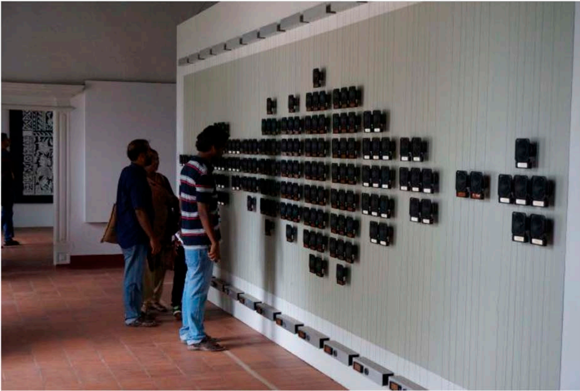
IMAGE: VISITORS LOOK AT PAN-ANTHEM, BY RAFAEL LOZANO-HEMMER AT THE KOCHI-MUZIRIS BIENNALE