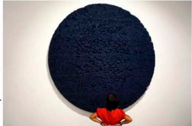
IMAGE: A GIRL CONTEMPLATES AN ARTWORK AT THE KOCHI-MUZIRIS BIENNALE

From the fourteenth century, Kochi was an important spice trading centre, and from the sixteenth century was occupied successively by the Portuguese, the Dutch and the British. In 2012, Kochi became home to India's very first contemporary art biennale, the Kochi-Muziris Biennale.