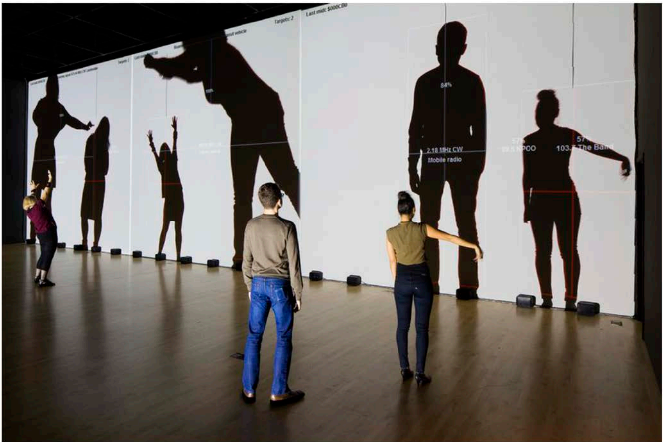
Rafael Lozano-Hemmer, Frequency and Volume, Relational Architecture 9 (2003); installation view at the San Francisco Museum of Modern Art, 2012

Rafael Lozano-Hemmer has made an audacious move. A renowned artist working across new media, architecture, theater, and performance, he has published the source code to forty-two of his works on a USB drive, which is being sold for $10 by his New York gallery. Many of the works belong to museums and private collections, raising some obvious questions about rights, distribution, and exactly what is on those drives: the works? partial versions of the works? instructions to make the works?