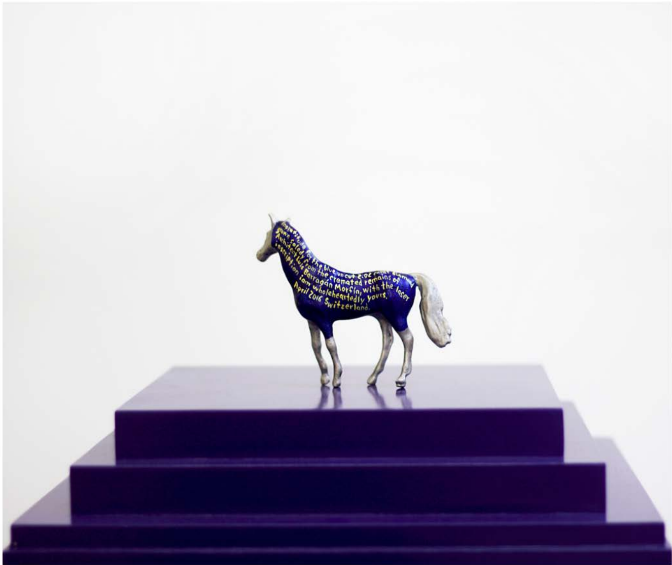
Jill Magid, "Ex-Voto: Miracle of the Diamond" (2016) (click to enlarge)

The exhibition at the Kunst Halle Sankt Gallen in Switzerland, The Proposal , was just that. By extension, the show in Mexico City is also a stage for potential action, which becomes performative when the artist reads her proposal to Zanco aloud in the exhibition space. "I don't see the exhibition as an artifact," she said. Nevertheless, through the exhumation of the