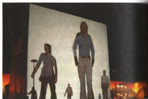
Figure 24. Rafael Lozano-Hemmer | Body Movies, Relational Architecture 6 , 2001 | Four 7kW Xenon projectors with robotic rollers, 1,200 Duraclear transparencies, computerized tracking system, plasma screen and mirrors. Dimensions variable | see endnote for full image credits. 3