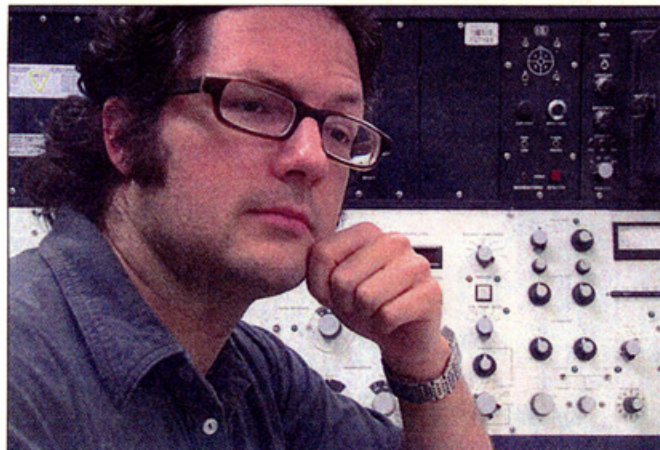
SEEING THE LIGHT: Bafta award-winner Rafael Lozano-Hemmer

will put the city on the map for hosting globally significant visual arts work. Full details of the project will be unveiled on June 29, when Rafael comes to Leicester for the official launch.