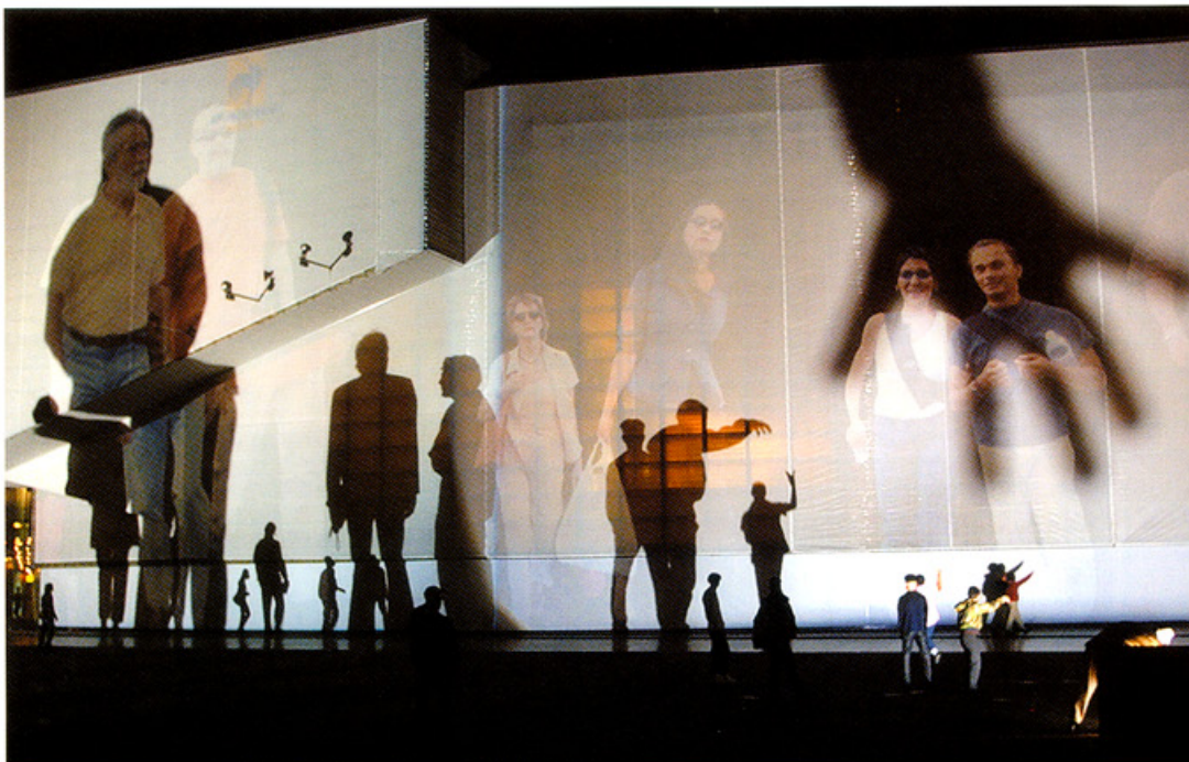
People interacting with Body Movies, Relational Architecture No.6 (2001) in a public square in Rotterdam, the Netherlands.